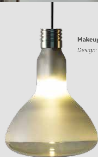
Makeup Design: Matteo Ugolini