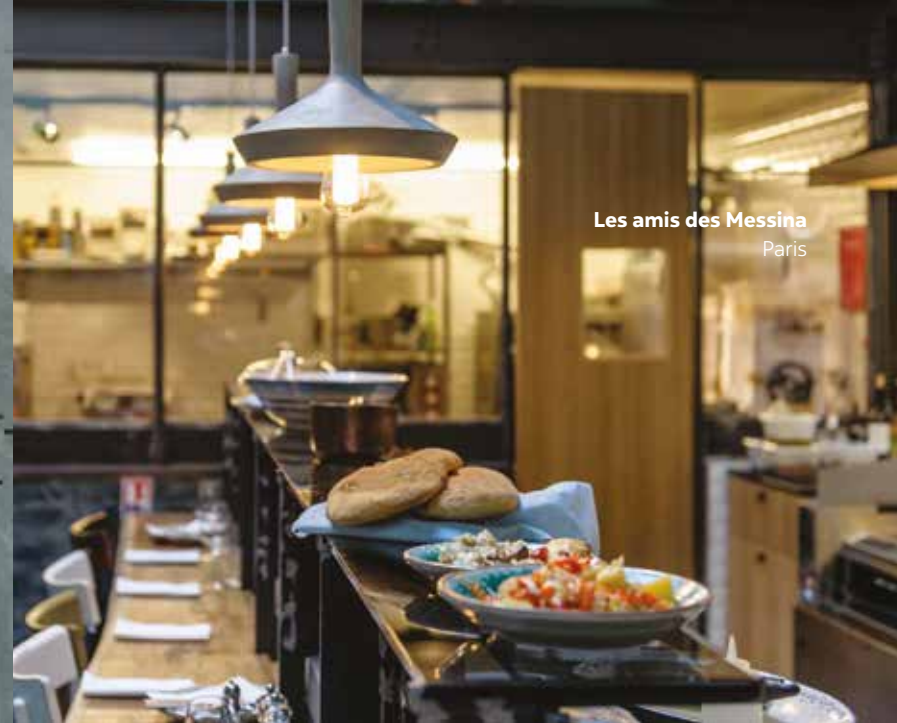
Les amis des Messina Paris