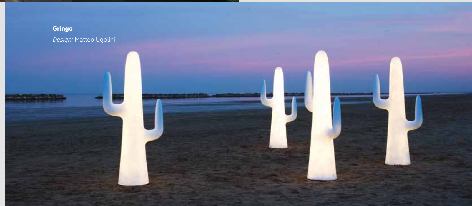
Gringo Design: Matteo Ugolini