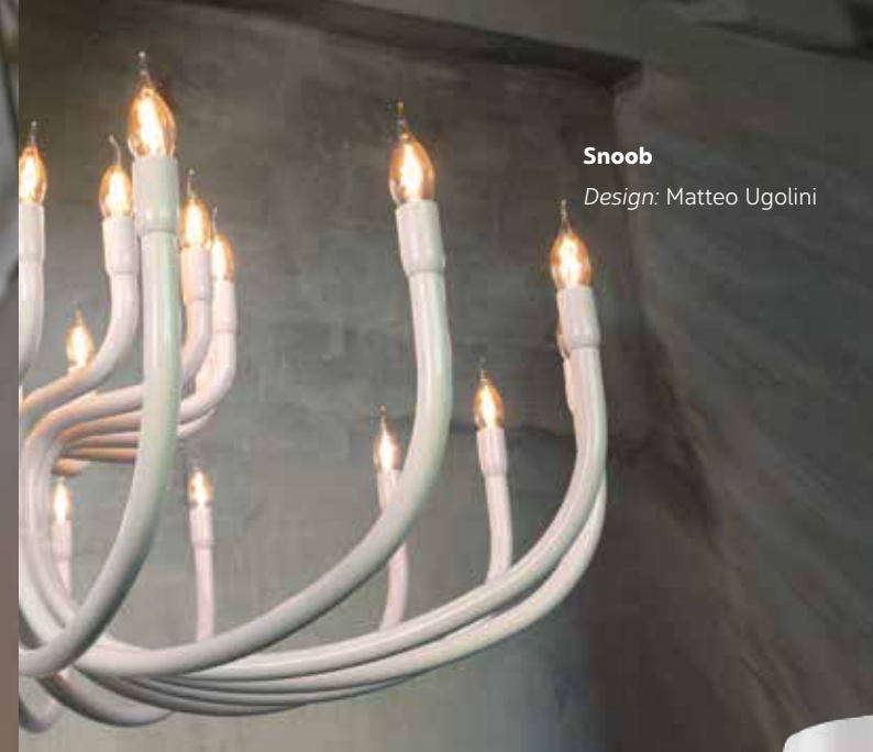
Snoob Design: Matteo Ugolini