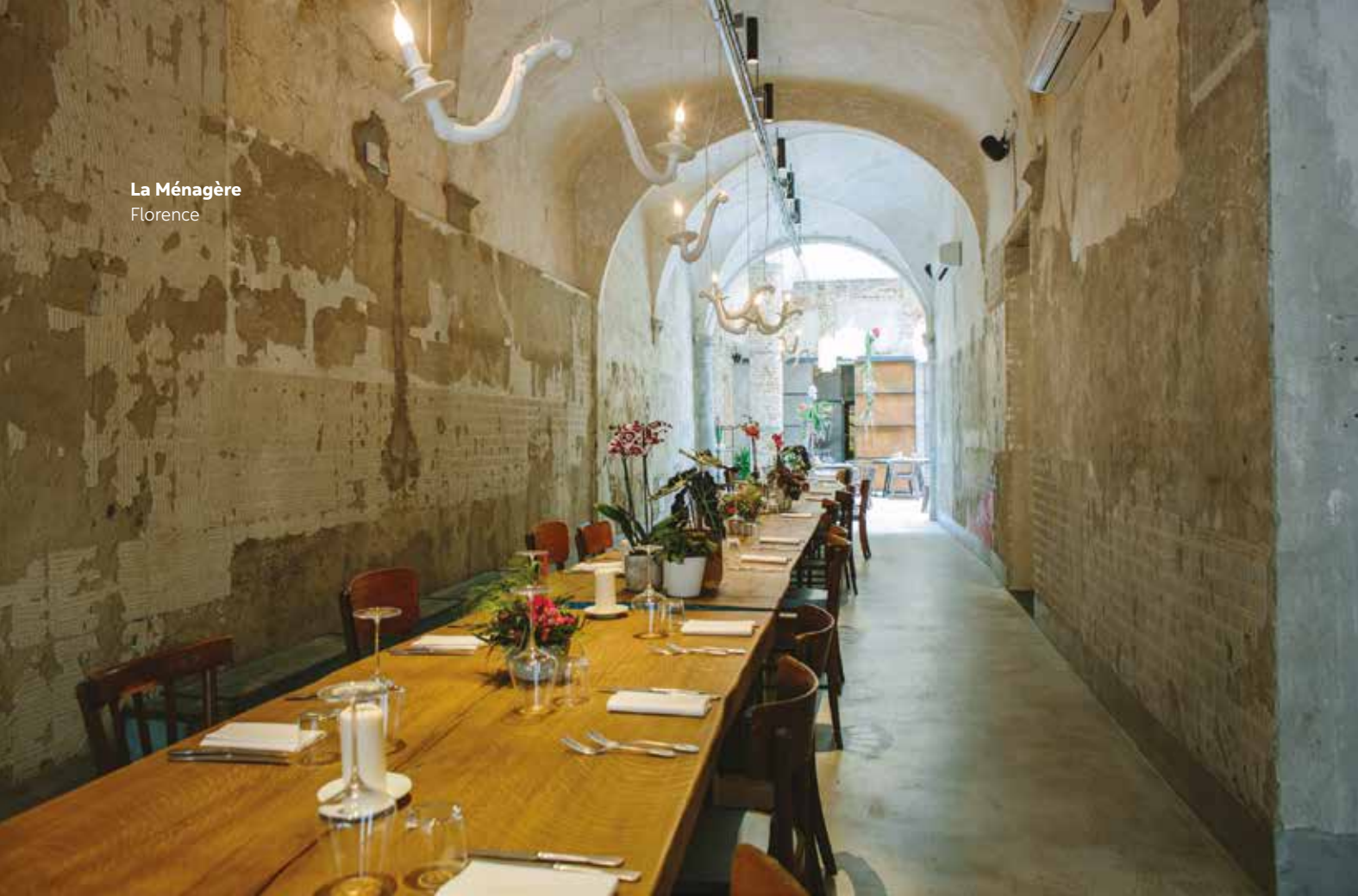
La Ménagère Florence