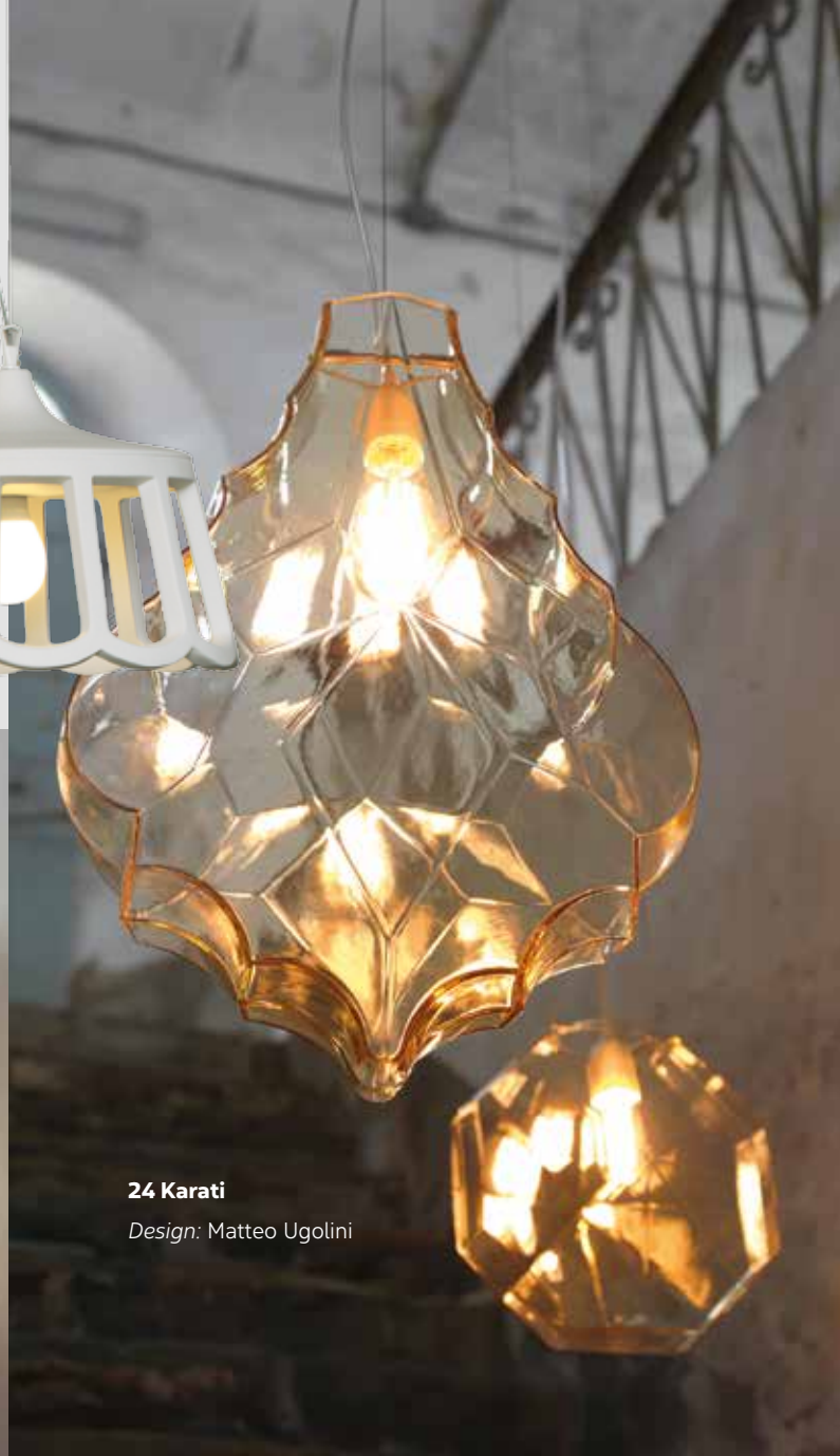
24 Karati Design: Matteo Ugolini