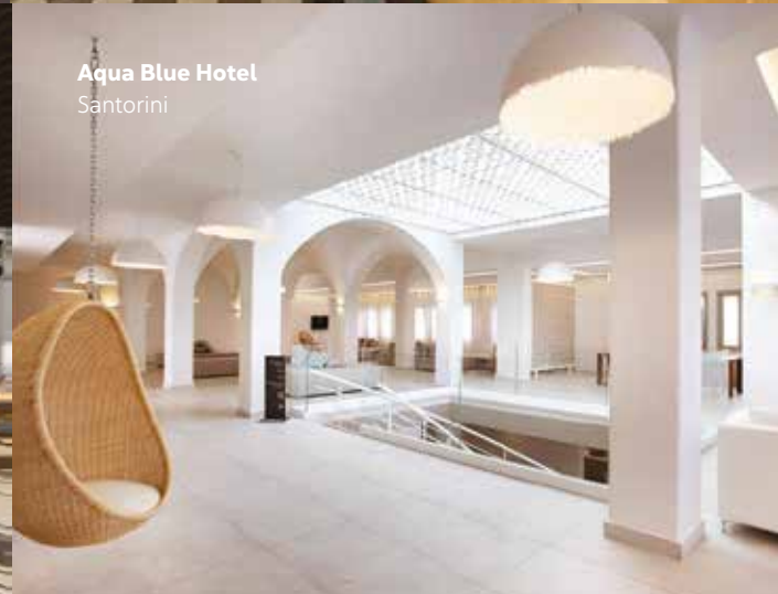
Aqua Blue Hotel Santorini