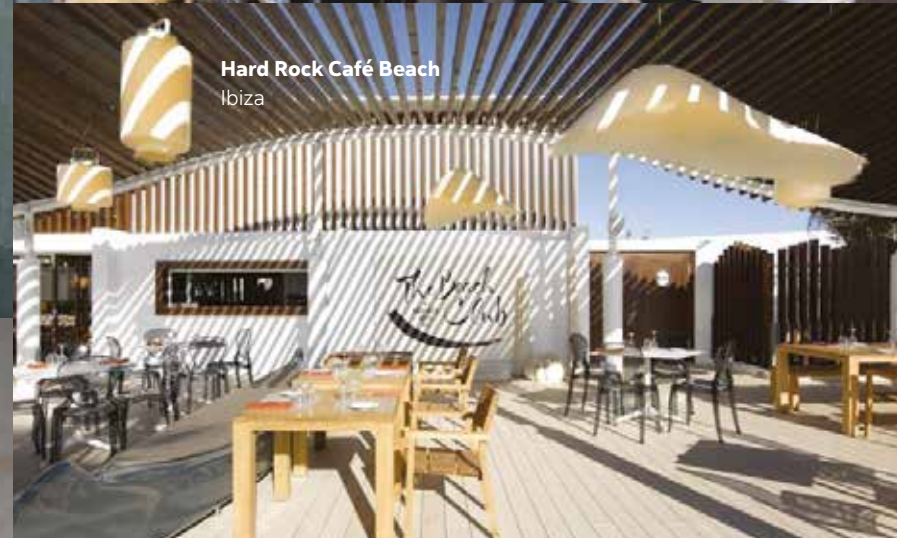
Hard Rock Café Beach Ibiza