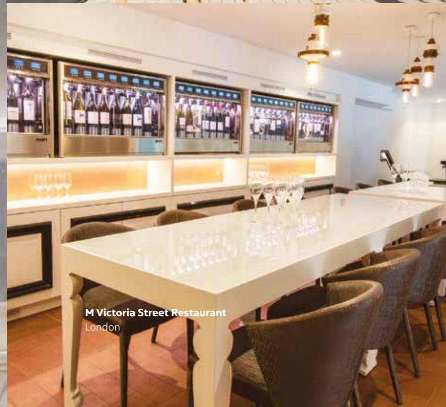
M Victoria Street Restaurant London