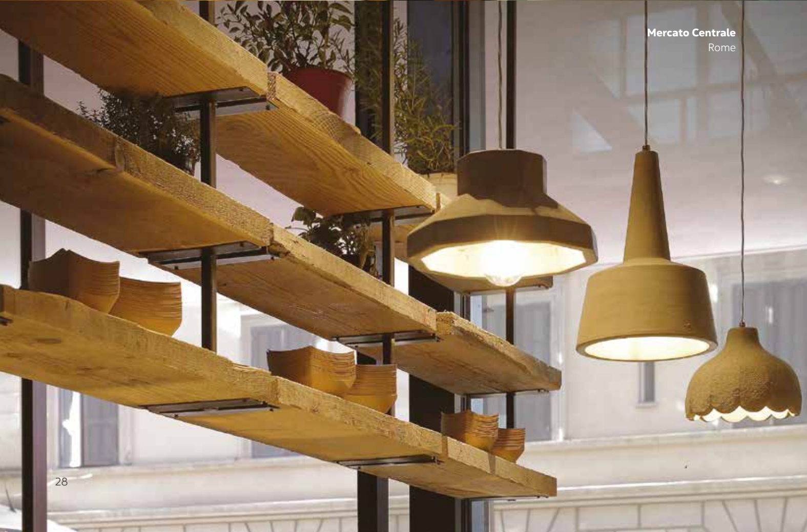
Mercato Centrale Rome