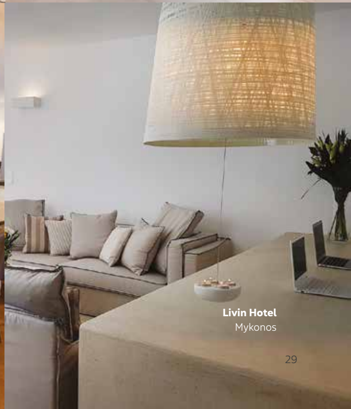
Livin Hotel Mykonos