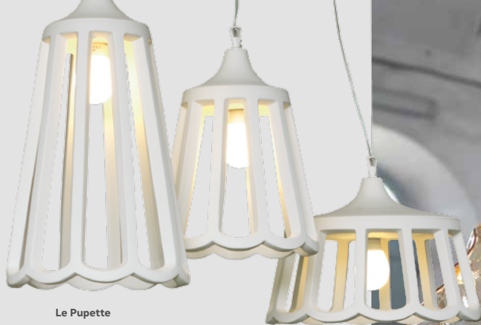
Le Pupette Design: Edmondo Testaguzza